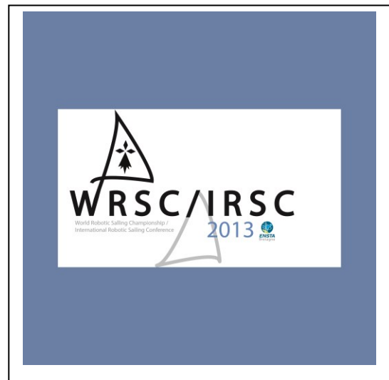
Fig. 1. WRSC/IRSC 2013.

The WRSC/IRSC 2013 (see [1] and Fig. 1) was the 6th edition in a series with previous events held in Austria (2008), Portugal (2009), Canada (2010), Germany (2011) and the Wales/UK (2012) (see [2]). The main novelty of this competition was to propose tasks designed for other types of surface vehicles in addition to sailboats.