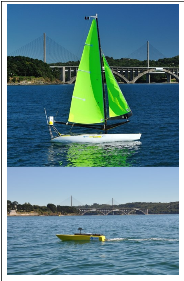
Fig. 4. ENSTA Bretagne – Ifremer team robots: VAIMOS autonomous sailboat and an autonomous motorboat built that year. VAIMOS was first at the endurance task and received the best sailboat in the open category award. The motorboat received a special prize for its success in the obstacle avoidance of known position task.

IRSC (International Robotic Sailing Conference) 2013 welcomed from the 2 nd to the 3 rd of September 2013 paper submissions on a wide range of topics around autonomous marine robotics (especially sailing robots), including but not limited to: