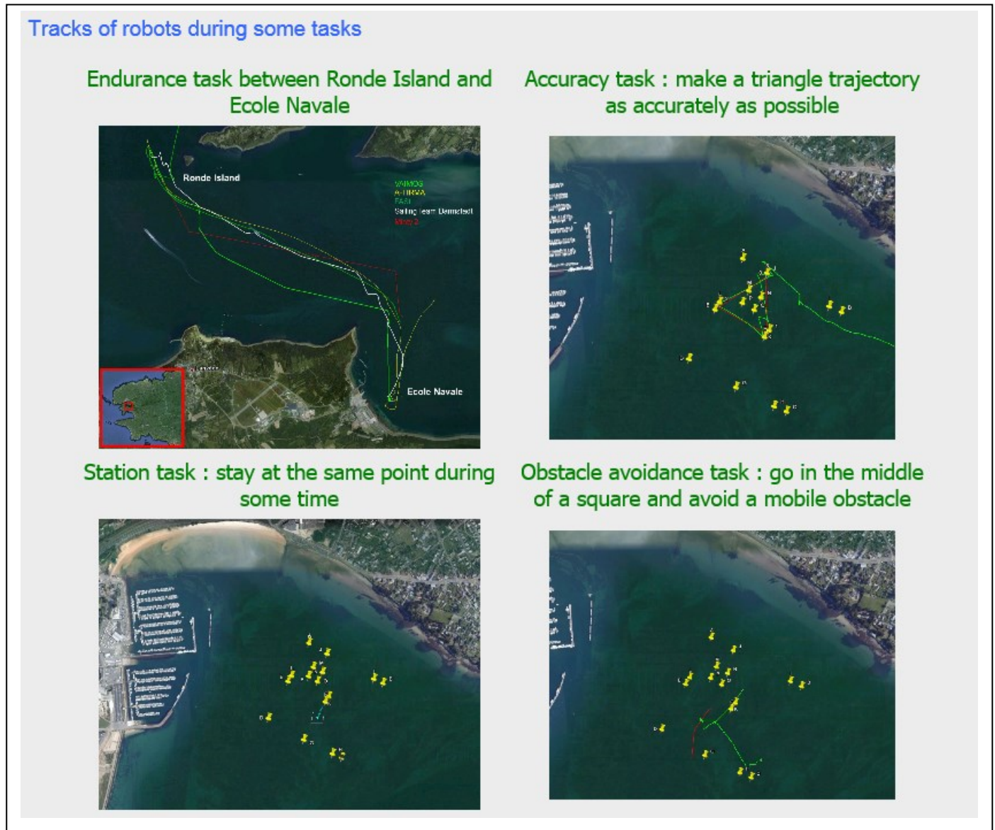
Fig. 3. Robots trajectories for several tasks.

A high number of tasks was proposed in the hope that new types of problems would be tackled by some teams, while other existing problems could still be studied by other teams. It was foreseen that no team would be able to reasonably try all the